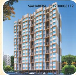
ARIHANT ANMOL Badlapur 1 & 2 BHK - 700 Flats