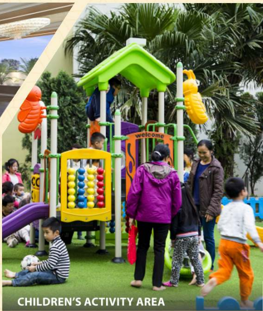
CHILDREN'S ACTIVITY AREA