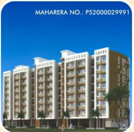
ARIHANT AMISHA Taloja (MIDC) 1 & 2 BHK - 600 Flats

ARIHANT SUPERSTRUCTURES LTD. CONTINUING STABILITY