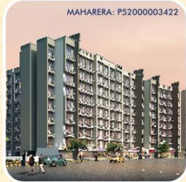
ARIHANT ARSHIYA Khopoli - Nr. Khalapur Toll Naka Studio Apt, 1 & 2 BHK - 1600 Flats