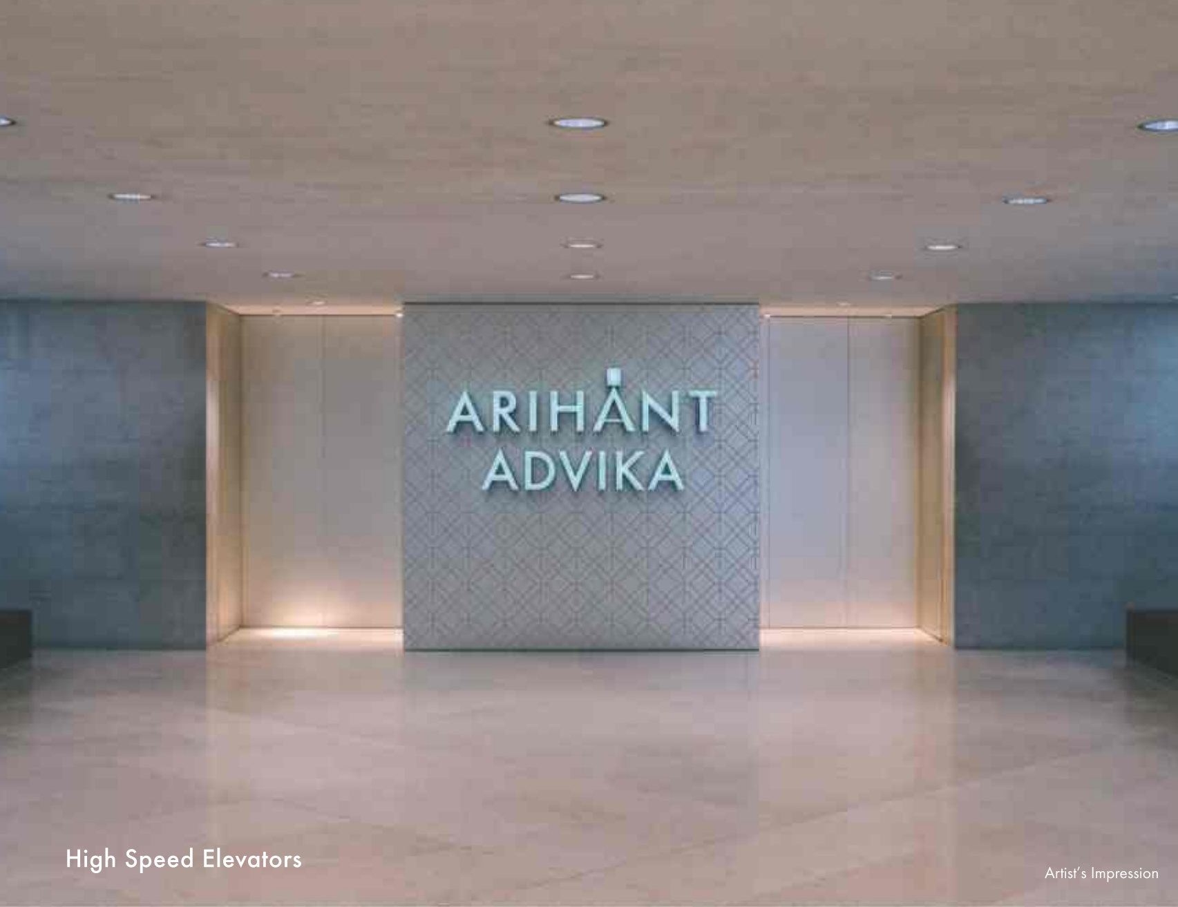
High Speed Elevators