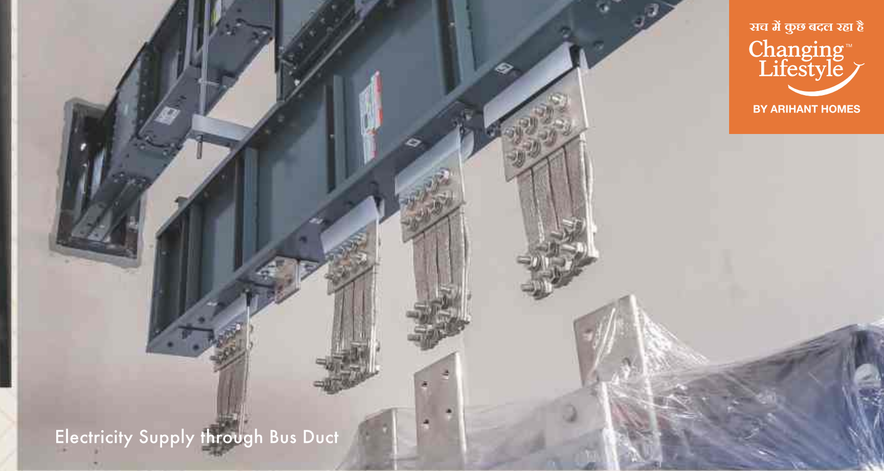
Electricity Supply through Bus Duct