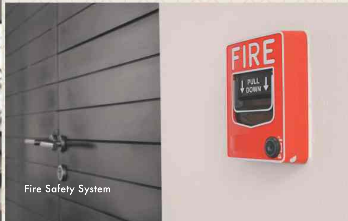
Fire Safety System