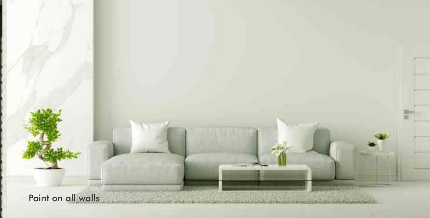
Paint on all walls