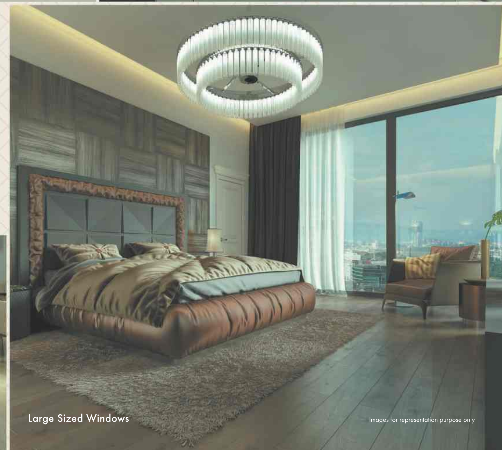
Large Sized Windows