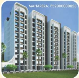
ARIHANT ANANT Taloja, Near Metro Station 1 & 2 BHK - 150 Flats