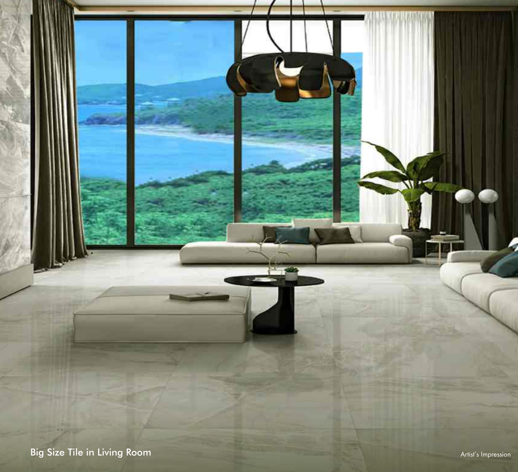
Big Size Tile in Living Room