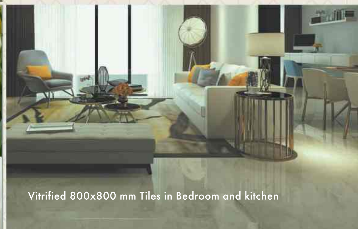
Vitrified 800x800 mm Tiles in Bedroom and kitchen