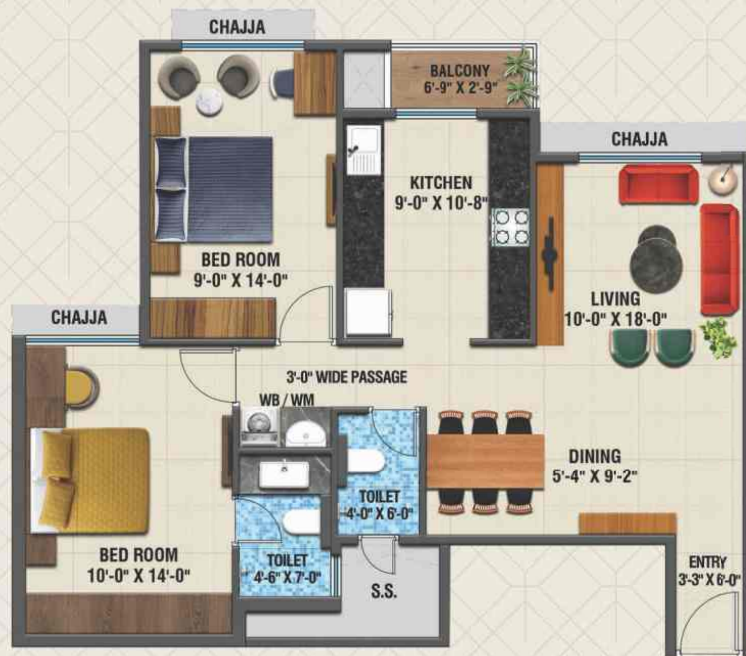
2 BHK LARGE TYPE B