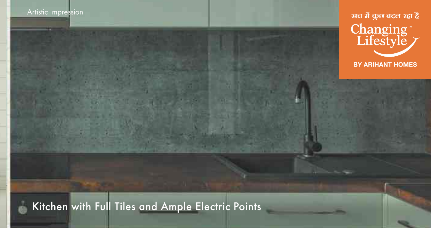
Kitchen with Full Tiles and Ample Electric Points