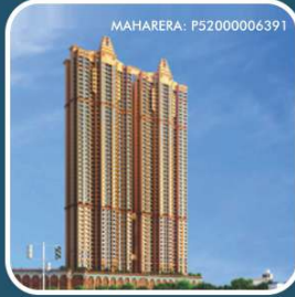
ARIHANT CLAN AALISHAN Kharghar Annex Big Studio, 1, 2 & 3 BHK - 1050 Flats