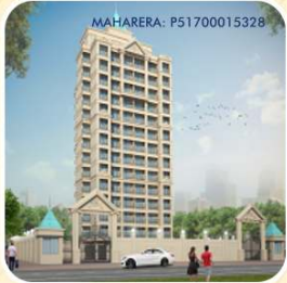
ARIHANT AAROHI Kalyan - Shil Road 1, 2 & 3 BHK - 258 Flats