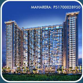
ARIHANT ADVIKA Vashi 2, 3, 4 BHK - 327 Flats

ALL PROJECT UNDER RERA REGISTRATION - Visit: https://maharera.mahaonline.gov.in