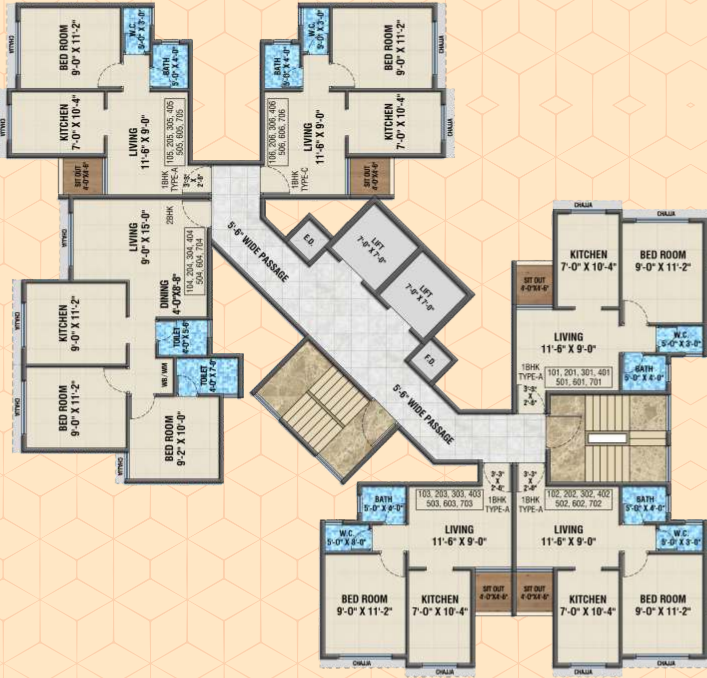
1 ST to 7 TH FLOOR PLAN Building - D3 & E2