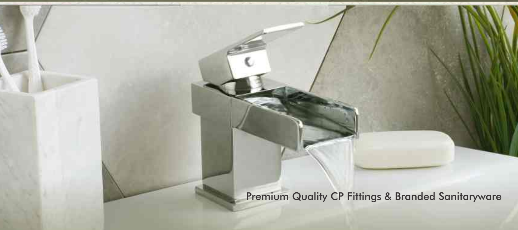
Premium Quality CP Fittings & Branded Sanitaryware