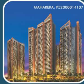
ARIHANT ASPIRE Palaspe - Panvel Lavish Studio, 2 BHK - 2700 Flats