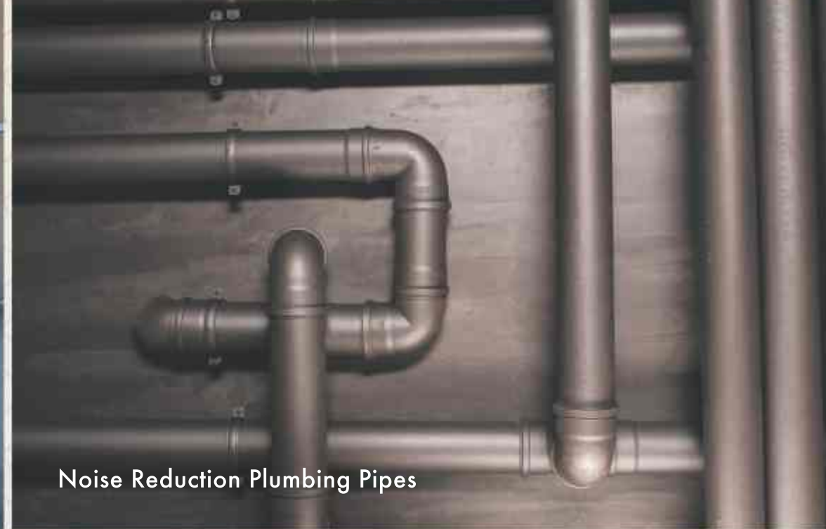
Noise Reduction Plumbing Pipes