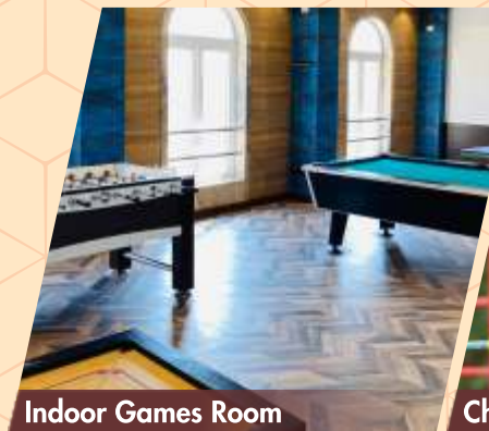
Indoor Games Room