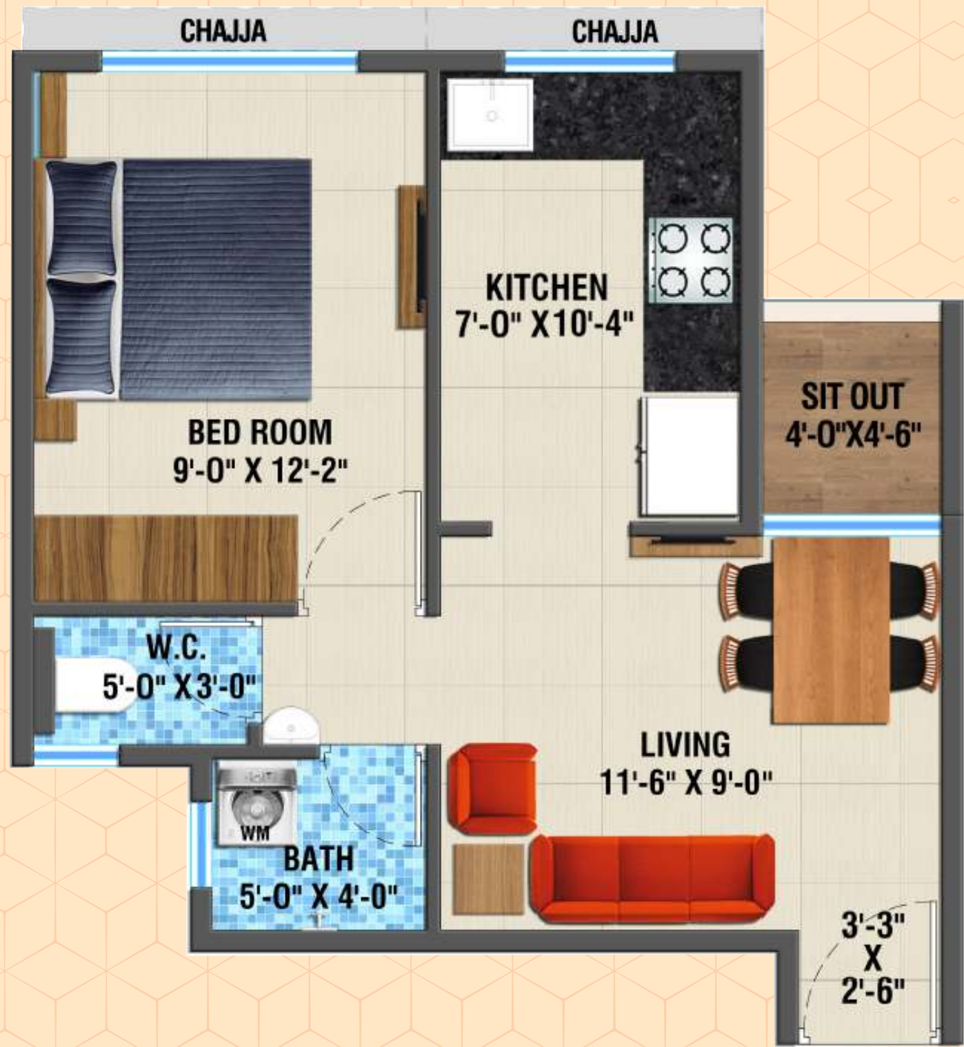
1 BHK FLOOR PLAN TYPE 2