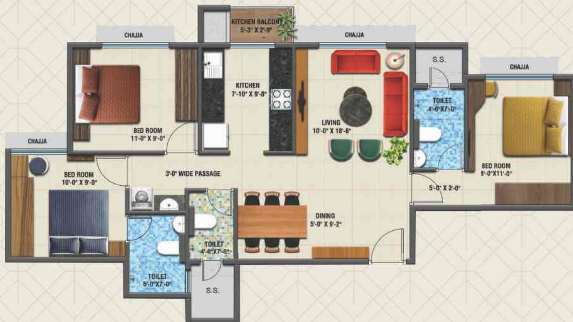
3 BHK MEDIUM TYPE D