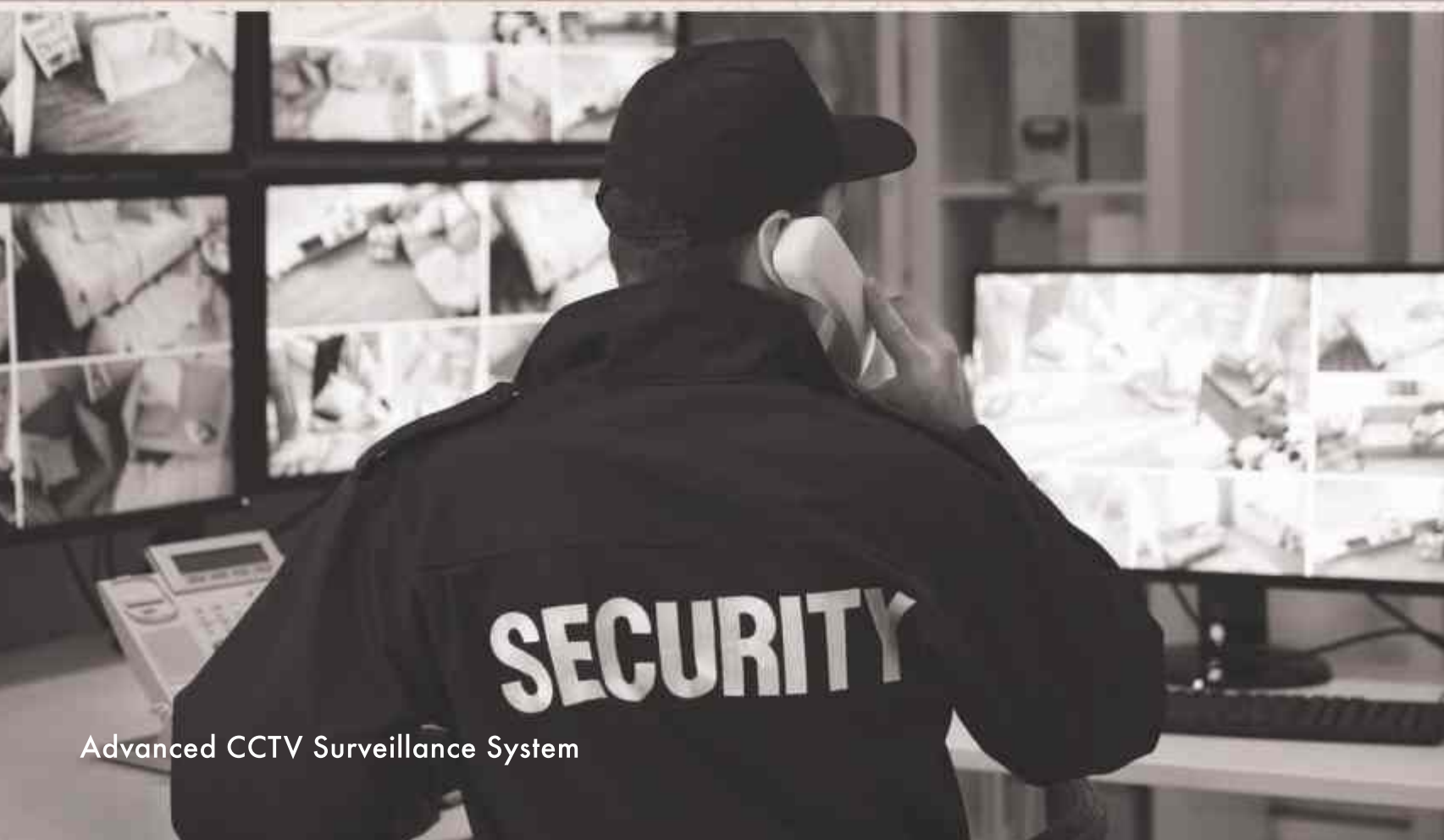
Advanced CCTV Surveillance System