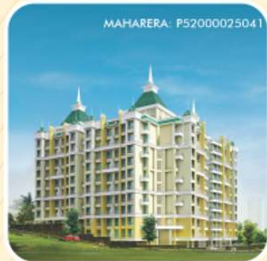
ARIHANT ALOKI Karjat - Nr. Railway Station 1, 2 & 3 BHK - 700 Flats